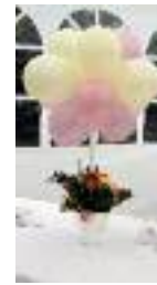
Left: Balloon decoration made by the learners